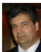
Rui Costa Portugal Vice President